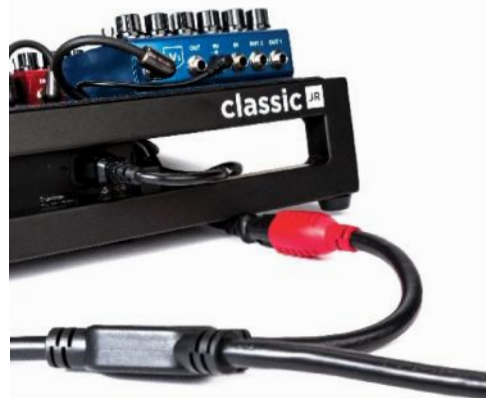
IEC Power Cable+