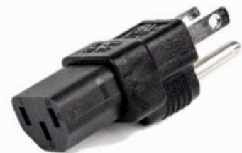
IEC to Plug Adapter