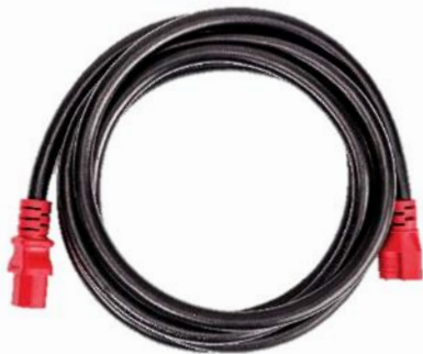
IEC Power Cable

The adapter and cables are available in NEMA, F, and G plug styles (NEMA shown below).